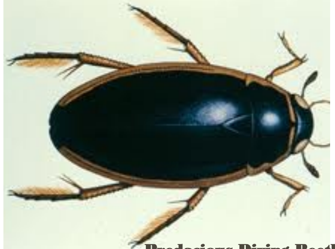
Predacious Diving Beetle